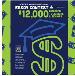
Kansas Masonic Foundation Scholarship