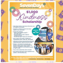
Seven Days Kindness Scholarship